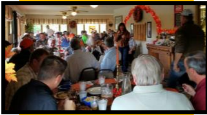
BUCHE MEMORIAL DINNER & PROGRAM