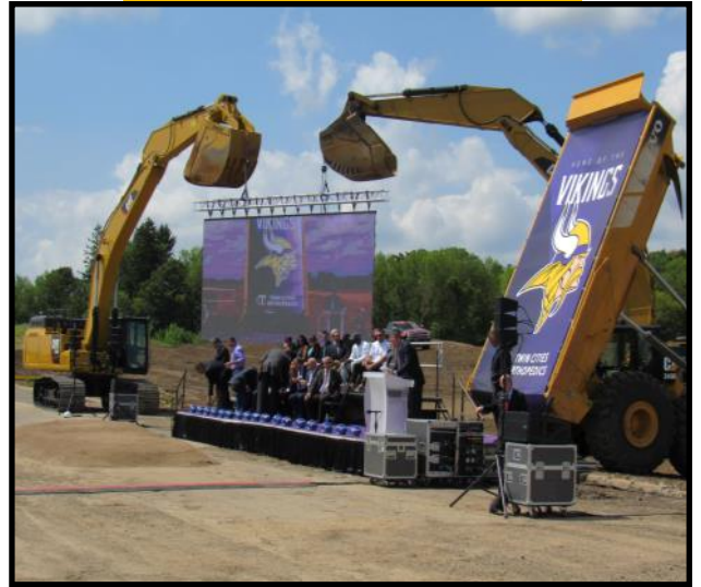
GROUND BREAKING CEREMONY - VIKINGS TCO PERFORMANCE TRAINING CENTER