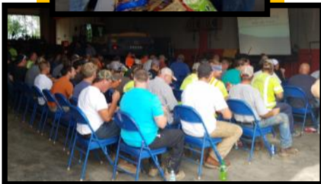
SUMMER COMPANY MEETING